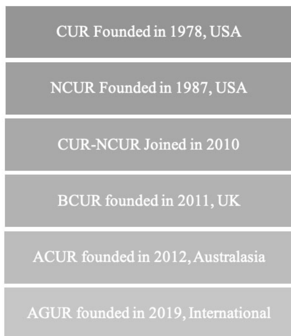
FIGURE 1. Founding Chronology of Undergraduate Research Organizations

(NCUR), established in 1987, continues to showcase student research prowess annually. CUR and NCUR were initially two separate organizations, but the two officially joined and NCUR became part of CUR in 2010, so it is not, as a conference, equivalent to the other councils. Since CUR was the first Council, it has been inspirational in the establishment of both the British Conference of Undergraduate Research (BCUR) in 2011 and the Australasian Conference of Undergraduate Research (ACUR) in 2012.