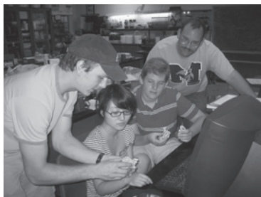
Undergraduates from the 2009 Missouri Western/Davidson iGEM team conduct synthetic biology research with a faculty mentor.