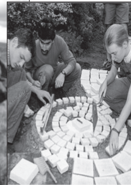
Australian undergraduate students engaged in research.

Several useful case studies on undergraduate research from the latter project are available on the Centre for Active Learning’s Web site ( resources.glos.ac.uk/ceal/resources/casestudiesactive-learning/undergraduate/index.cfm ).