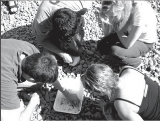
Australian undergraduate students engaged in research.

focusing their efforts on teaching well” (Department of Education and Skills, 2003, 55). While the U.S. higher-education system has developed a wide range of institutions, internationally there are a number of systems that until recently strove for similarity of institutional missions, including connections between teaching and research. Such systems now are becoming increasingly differentiated on U.S. lines, developing international-level research universities and other more local, vocationally focused higher-education institutions.