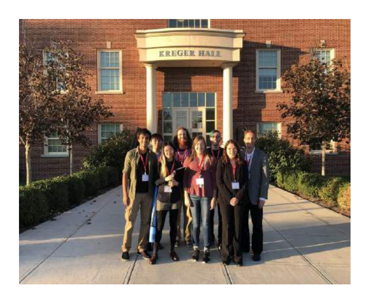
College of Wooster contingent