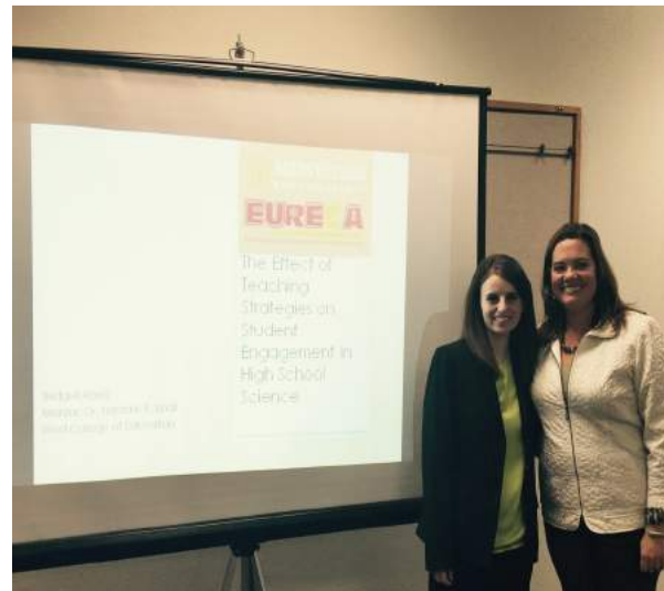
Student researchers at Midwestern State University (TX).