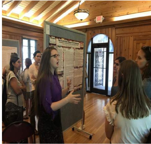
First Department of Education Poster Session at Rollins College (FL).