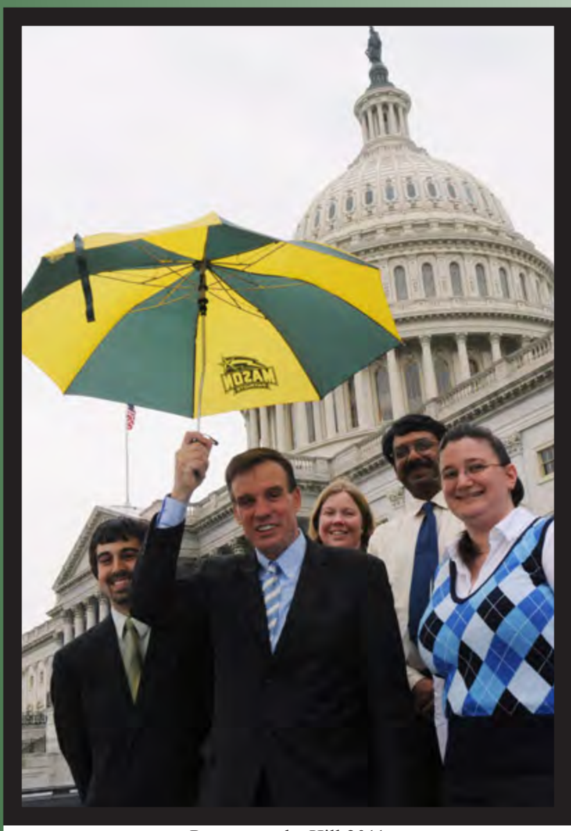
Posters on the Hill 2011