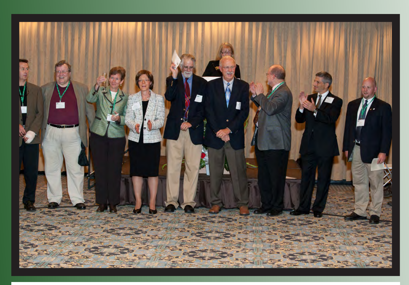
CUR-NCUR Celebration October 2010 at the Library of Congress.