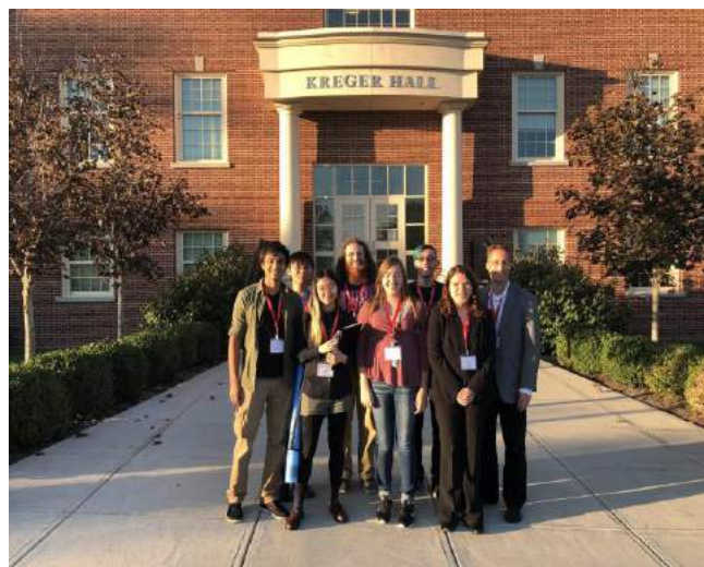
College of Wooster contingent