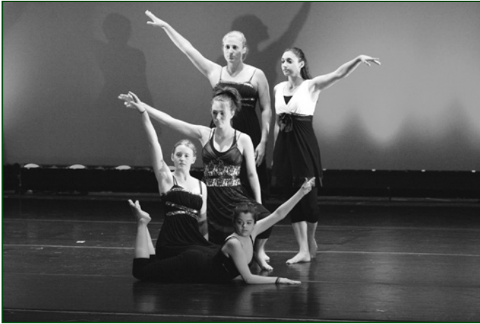
Dance students in the Department of Performing Arts demonstrate the creation of a modern piece of choreography.

articles addressed the philosophy of scholarship in the disciplinary areas and provided insight into specific scholarly activities of students. In the sixth article, the university's president officially invited the public to COS. Moreover, prior to the columns, the paper ran a two-page feature article, complete with pictures that focused on the student research.