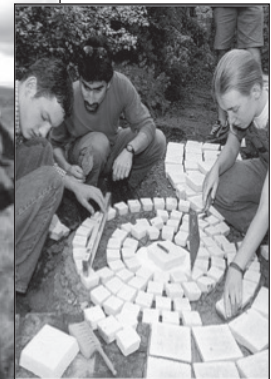
Australian undergraduate students engaged in research.

Several useful case studies on undergraduate research from the latter project are available on the Centre for Active Learning’s Web site ( resources.glos.ac.uk/ceal/resources/casestudiesactive-learning/undergraduate/index.cfm ).